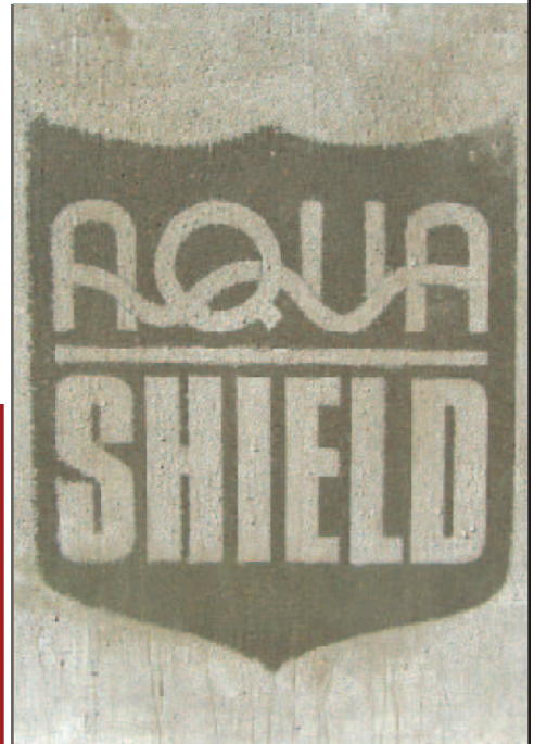
In the photo above, a concrete slab was treated with Ameripolish® AquaShield™ Waterproofing Treatment, all except the 'shield' outline, which was masked off and remained untreated. When sprayed with water, the untreated section absorbed water and turned dark. Water beaded up on the AquaShield treated area, and it looks completely dry.

Inhalation: Remove victim to fresh air. If necessary, use artificial respiration to support vital functions. If adverse effect continues after removal to fresh air seek medical attention.